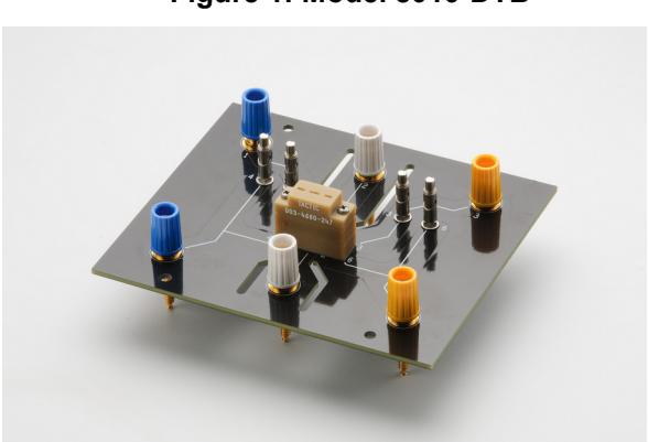
Figure 1: Model 8010-DTB

The Model 8010-DTB is used to test 2-terminal axial-lead devices and 3-terminal devices in a TO-247 package. This test board is used with Keithley Instrument Models 8010 High Power Device Test Fixture and 8011 High Current Test Socket Kit.